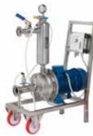
E-Flot 5 Eco