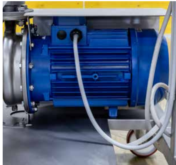
SPECIFIC CENTRIFUGAL PUMP FOR FLOTATION

The angle of the pump fins has been modified to ensure ideal pressurisation of the must.